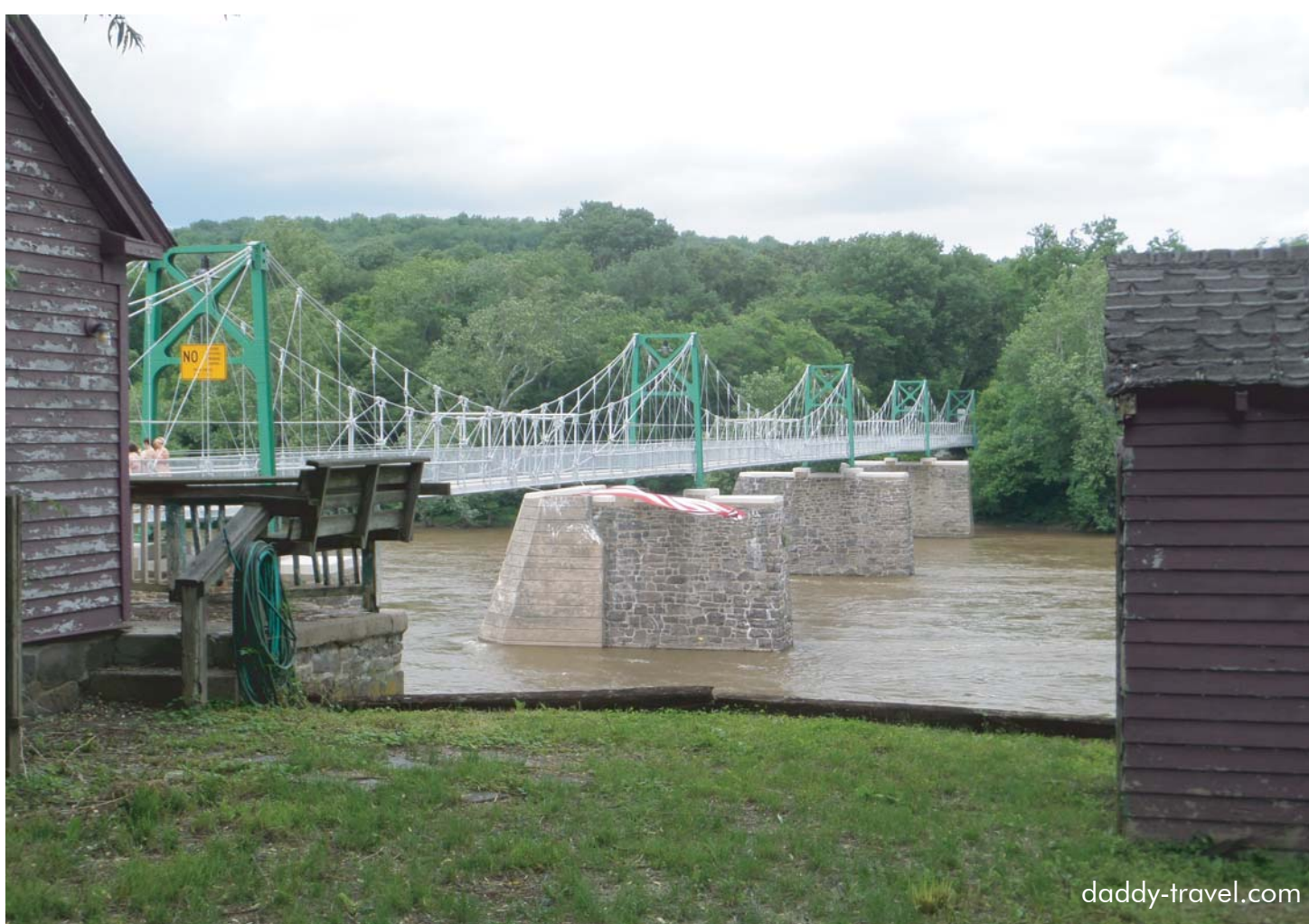
Roebling Foot Bridge at Lumberville

How is the towpath different from other trails?