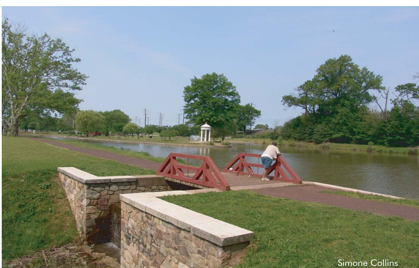
Canal lagoon at Bristol

Where does transit service reach the Delaware Canal?