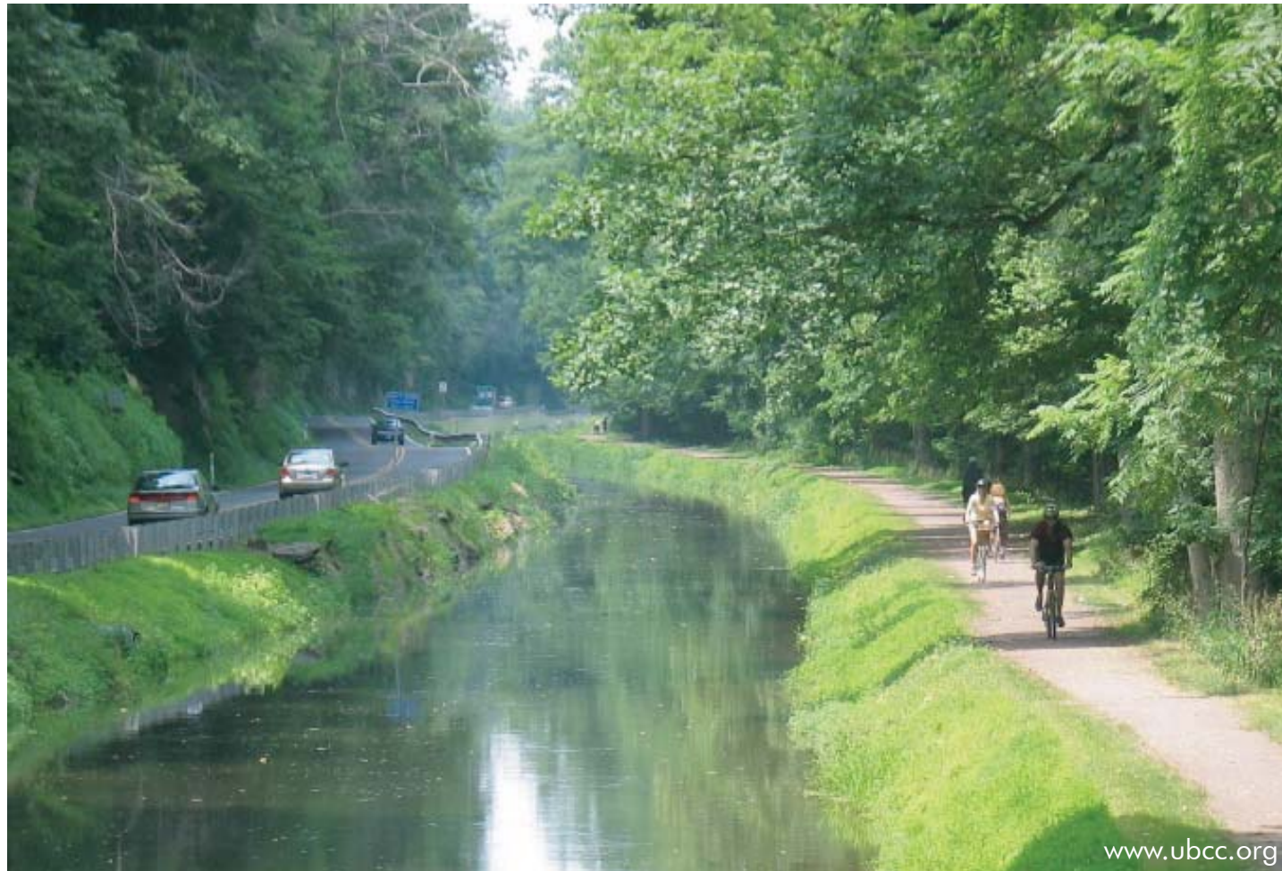
River Road Scenic Highway

Who uses the Delaware Canal, and how? How can public uses be improved?