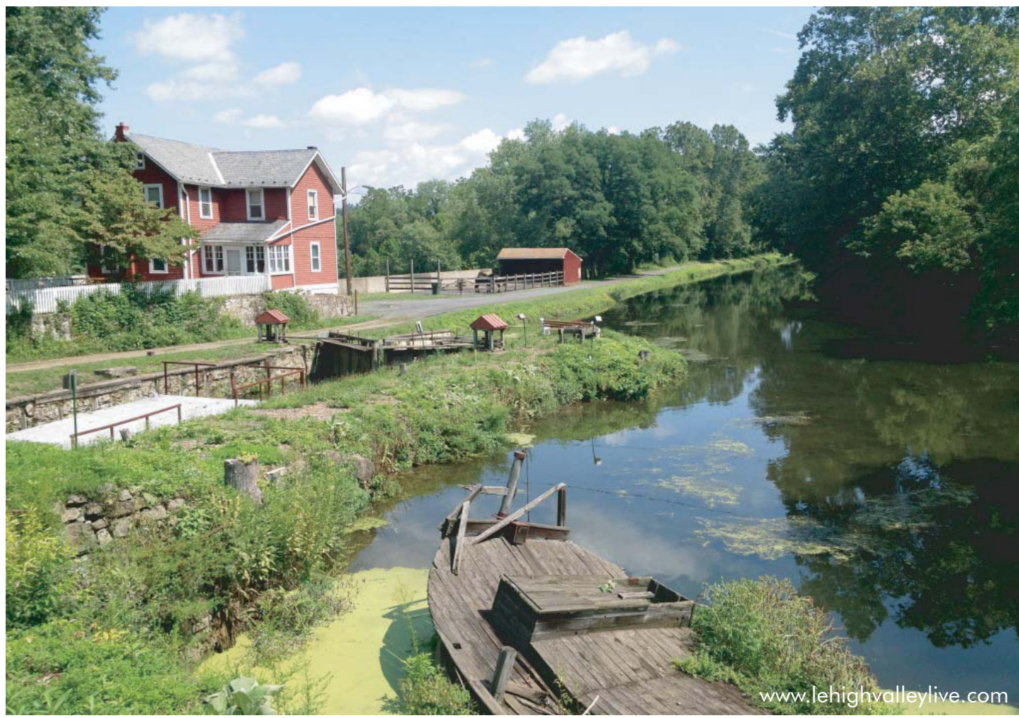
Hugh Moore Park and the Forks of the Delaware

Protecting and evoking the Wild and Scenic designation to conserve the Canal