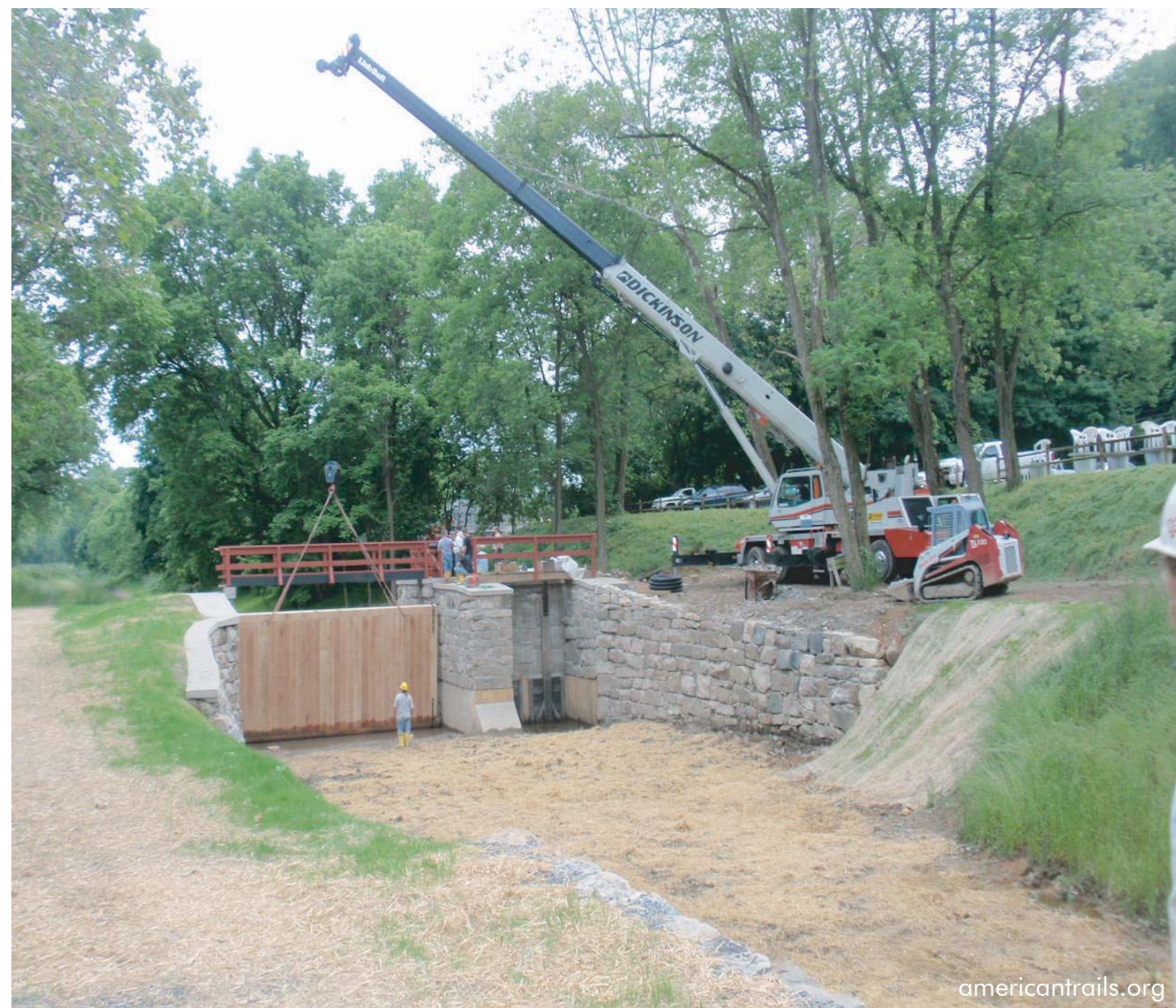
Instaling bridge along Delaware Canal

Wild and Scenic designation benefits to Canal communities and their economies