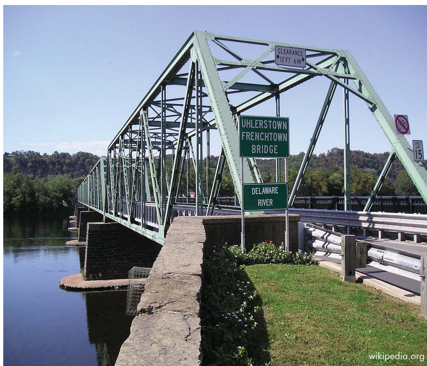
Uhlerstown Frenchtown Bridge

Protecting and evoking the Wild and Scenic designation to conserve the Canal