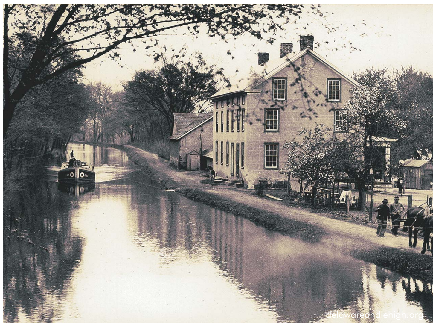
Mule Barge along Delaware Canal

Recreational uses that can support maintenance