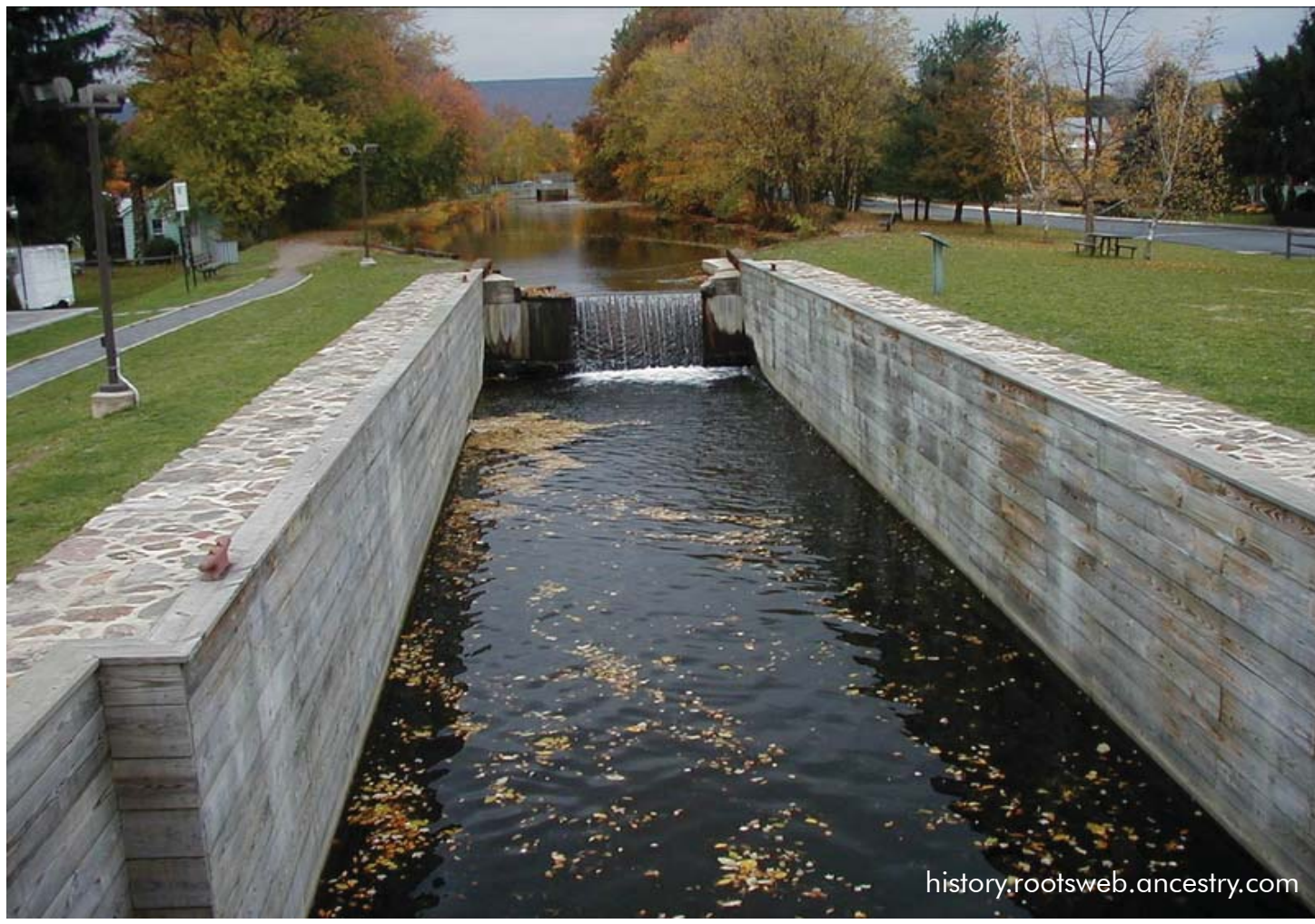
Lock 23 along Delaware Canal

Historic watering methods vs. modern demands for recreation, conservation, etc.