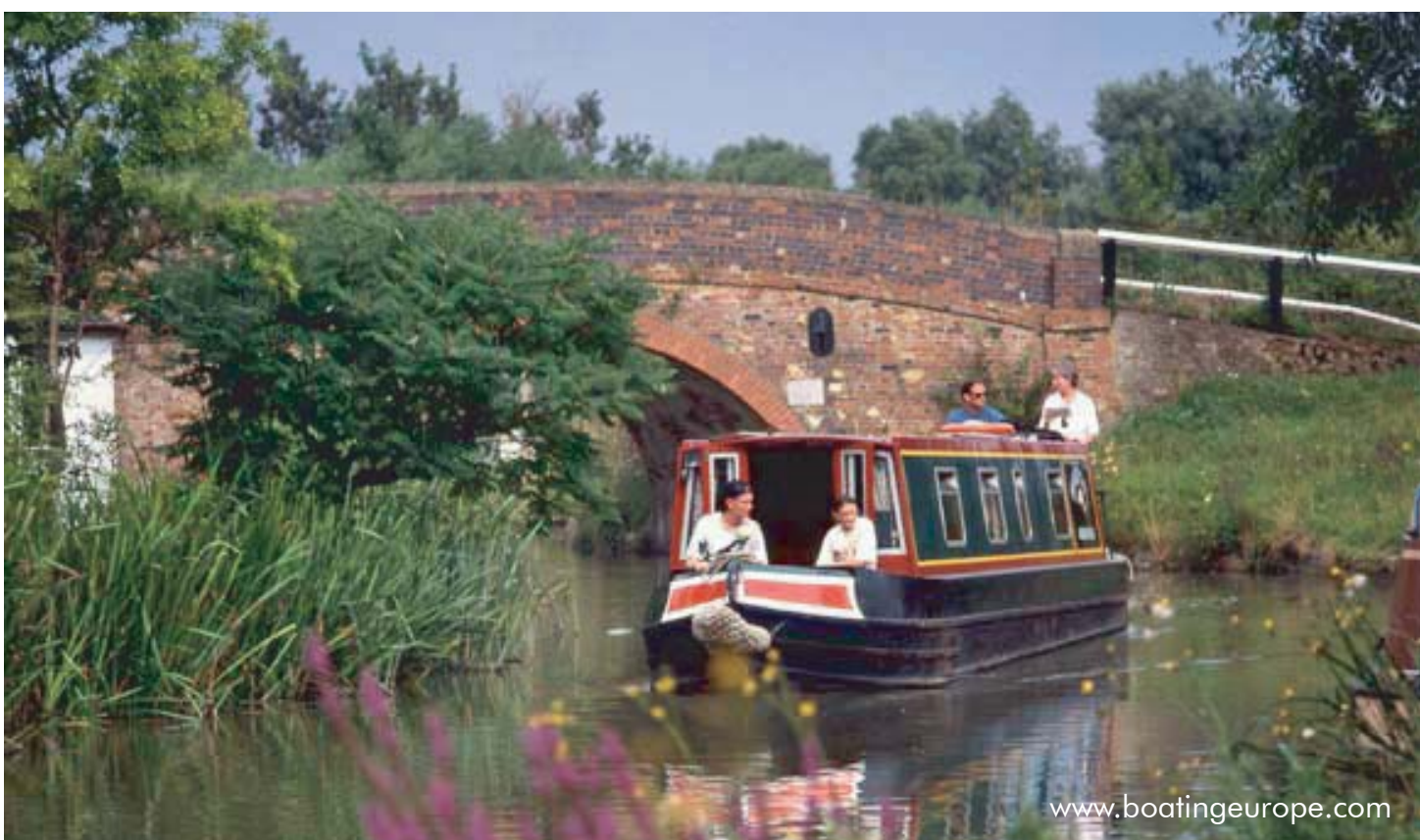
Canal boating in Europe

Historic watering methods vs. modern demands for recreation, conservation, etc.